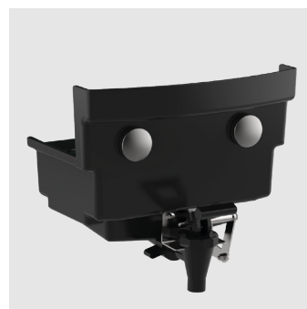
Injected Self Service Tray