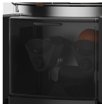
Smoky grey front cover